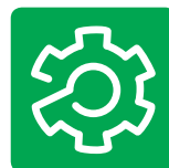
Industrial Process Control