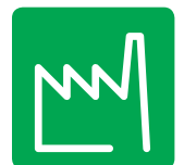
All Industrial Applications