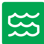
Water Treatment & Desalination