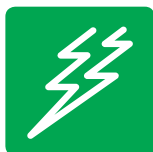
Energy & Power-Generation